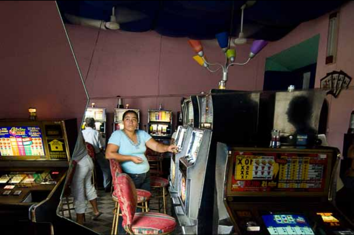
Photography & Change in Santa Fe Humanitarian Documentary Workshops